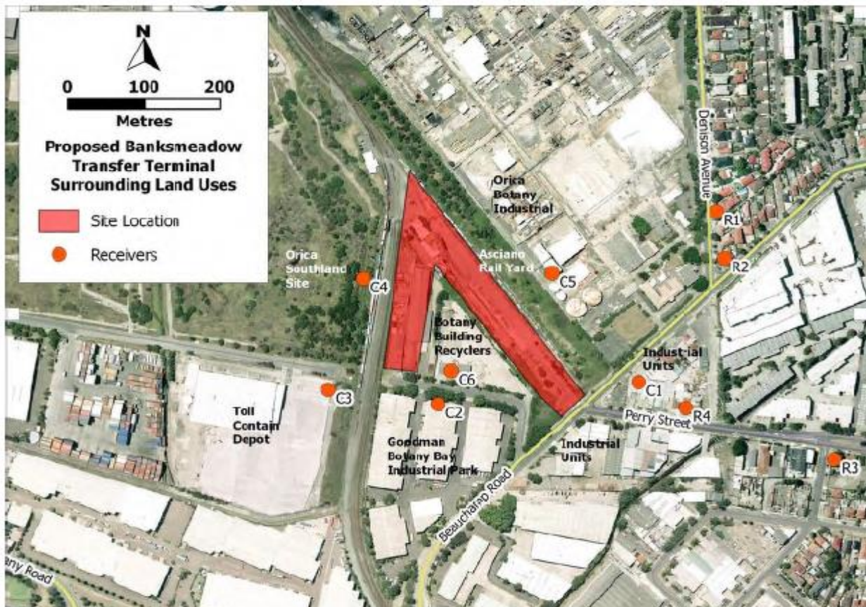
Figure 3.1 Sensitive receivers within proximity of the BTT site